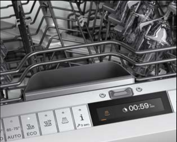
The programme options