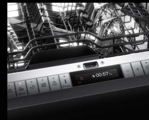
The TFT display

*At a range of energy efficiency classes from A+++ to D.